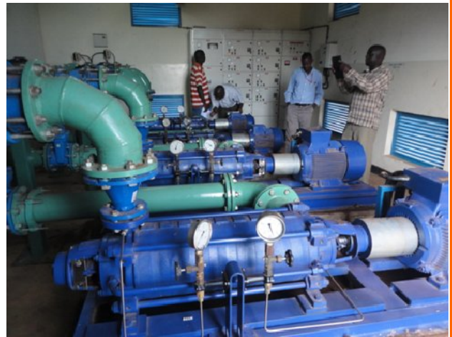
Above: Technical backup to member schemes: cUWS technical team inspecting the pumping system of one of its member schemes.