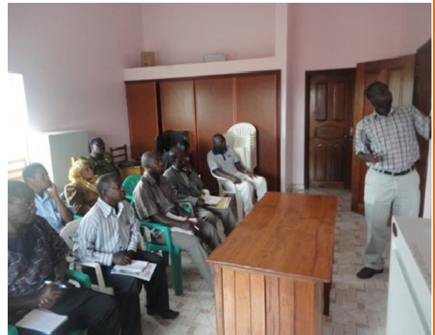
Above: Capacity building to WSSBs: A training session in progress for one of cUWS member schemes